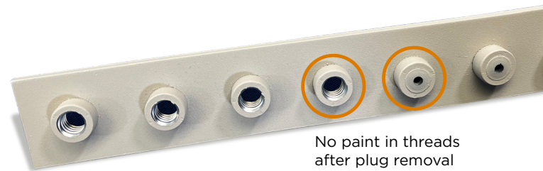
No paint in threads after plug removal